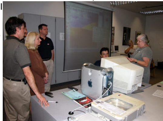
Graphics design program and admiring the new Apple computers.

Although we had just a hand full show up for the tour (due to election day), guests were from GRU, Cox Communication, Clay Electric and Staff Training Solutions were very impressed and excited about the tour. Afterwards they headed to their monthly board meeting and were already boast SFCC's ITE programs and facilities to the other AITP members. We'll plan a tour again in spring for all of those who missed out. See the SFCC CyberSaints website at www.cybersaints.org